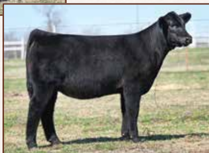
PCOL LUCY Daughter of Lot 3