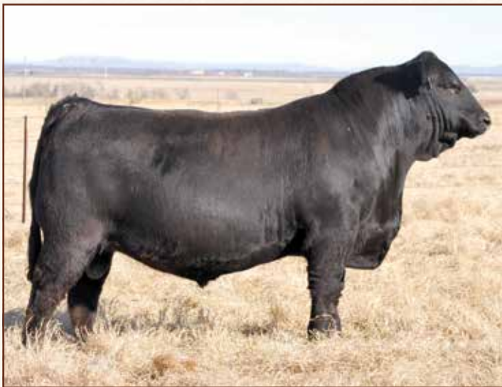
CHR GOOD FELLA 137G • Sire of Lot 17A