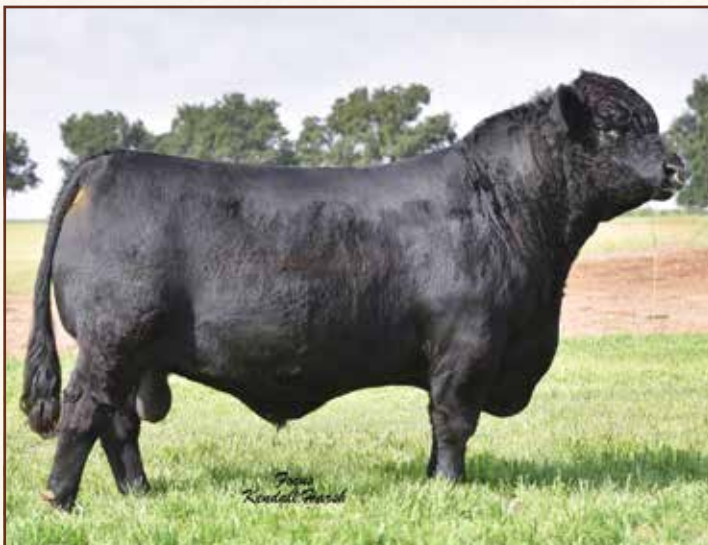
LFL DELUXE EDITION 6029D ET • Paternal grandsire of Lot 33A