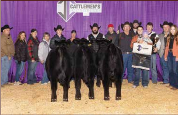
2024 Cattlemen's Congress Grand Champion Lim-Flex Pen, People's Choice Grand Champion Lim-Flex Pen Shown by Lawrence Family Limousin, Anton, TX