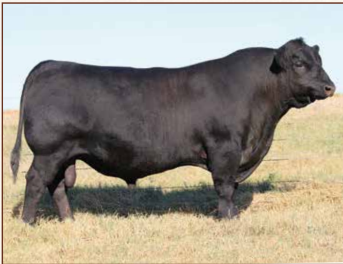
MAGS EAGLE • Sire of Lot 29