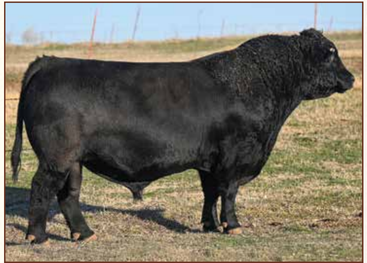
CHR FREE AGENT 215F ET