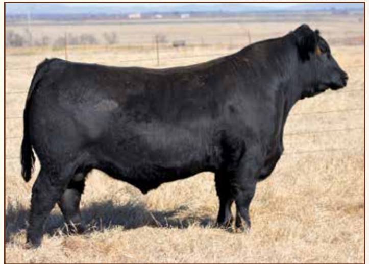
LFL GENETIC VALUES 9148G ET • Sire of Lot 85