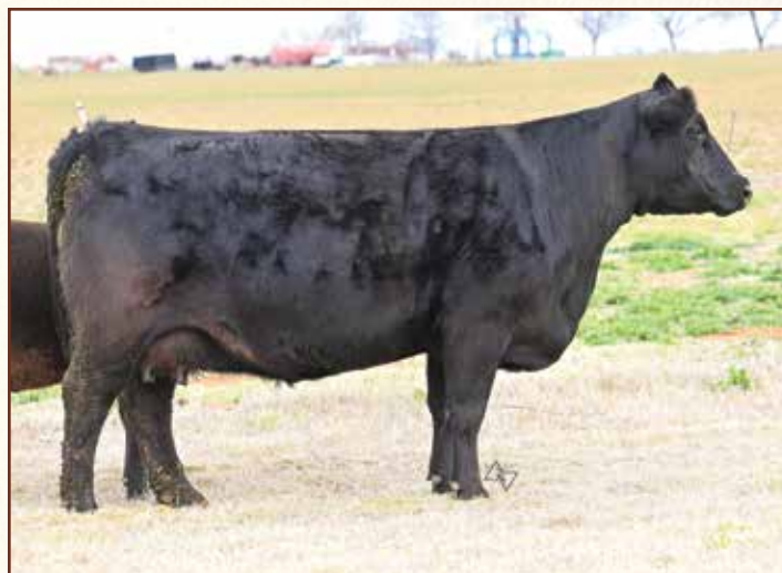
LFL FATEFUL 8123 F • Dam of Lot 55, sells as Lot 14