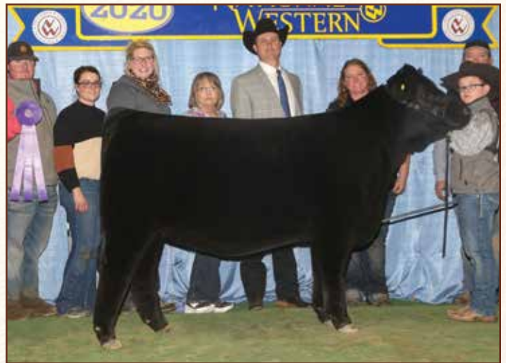
LFL FIESTA 8126 F • Dam of Lot 86