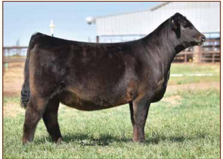
LFL FALLEN ANGEL 8114F ET • Dam of Lot 78