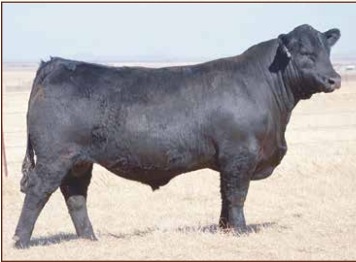
CHR HARD ROCKS 151H