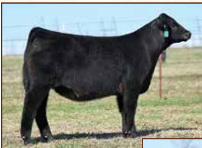
PCOL LUCKY Daughter of Lot 3