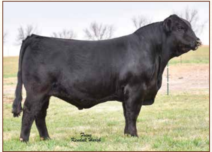
LFL DIVIDEND 6084D ET