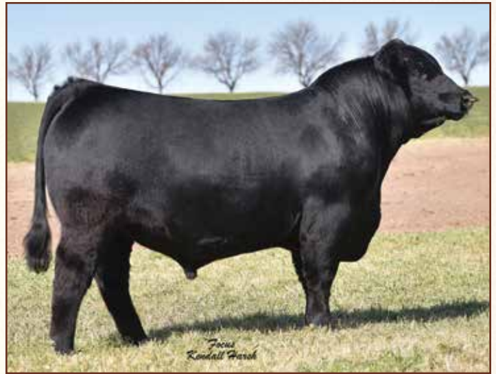
LFL ELLIS 7303E ET • Sire of Lot 32