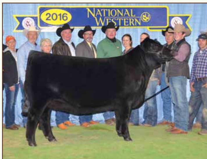
LH BELLE 015B • Maternal sib to Lot 15