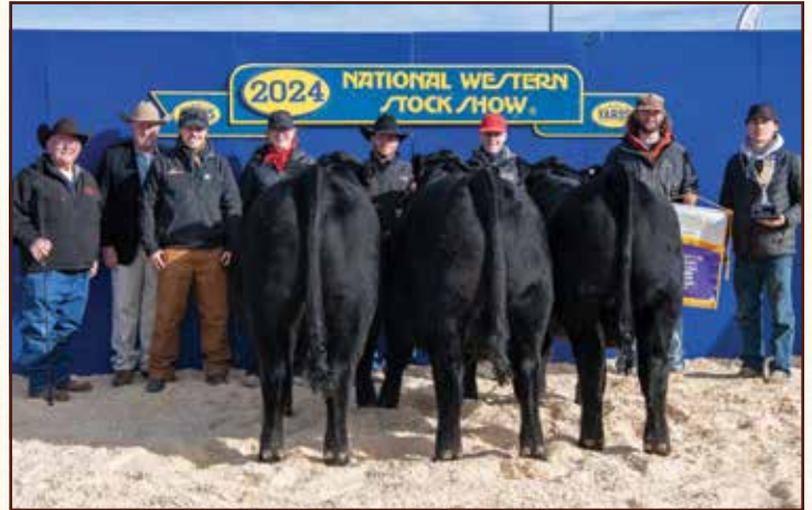
2024 National Western Stock Show Grand Champion Lim-Flex Pen Shown by Lawrence Family Limousin, Anton, TX